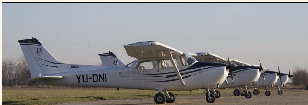
Prince Aviation Cessna 172 Skyhawk training fleet