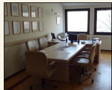
Prince Aviation Training Center – Classrooms and Offices