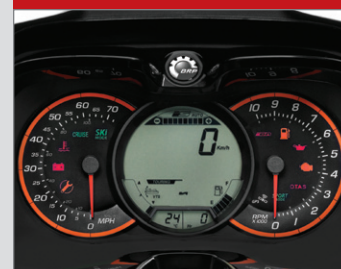
Driving Center with ECO mode