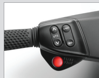
High-performance VTS ™ (Variable Trim System) control