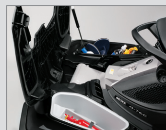
Reboarding platform with storage

This machine was designed with one thing in mind. Performance. With the exclusive benefits of iControl ™ , saying this is an exhilarating muscle machine is an understatement. Its handling characteristics are enhanced by the S 3 Hull ™ and the world's first Intelligent Suspension (iS ™ ) on a watercraft that can be calibrated for a different riding style.