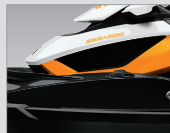
iS (Intelligent Suspension)